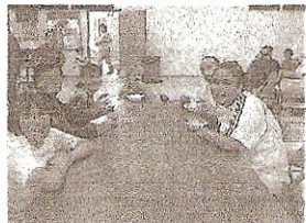
Enjoying banana splits at the Back-to-School Potluck!