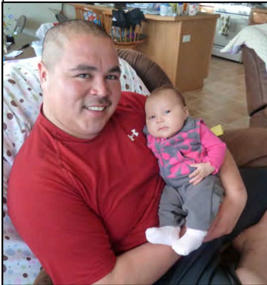
ONE MONTH OLD