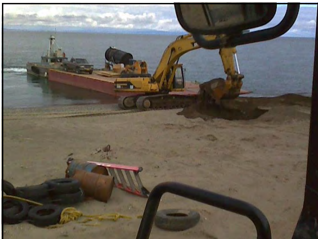
Last barge load...look at our new burner!