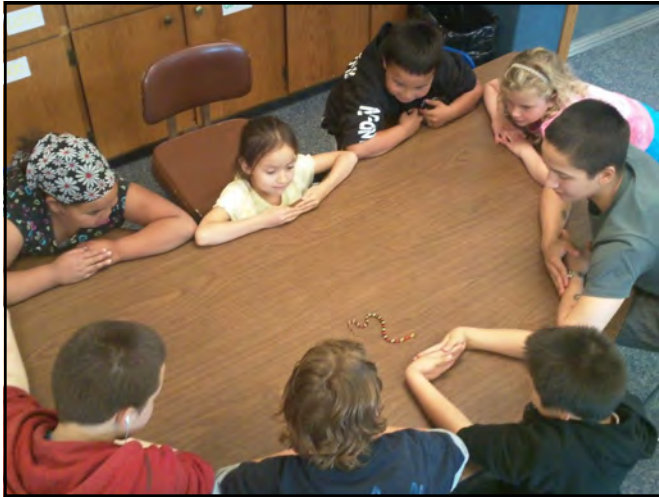
Igiugig Students enjoying their new class pet; a milk snake named Sirius.