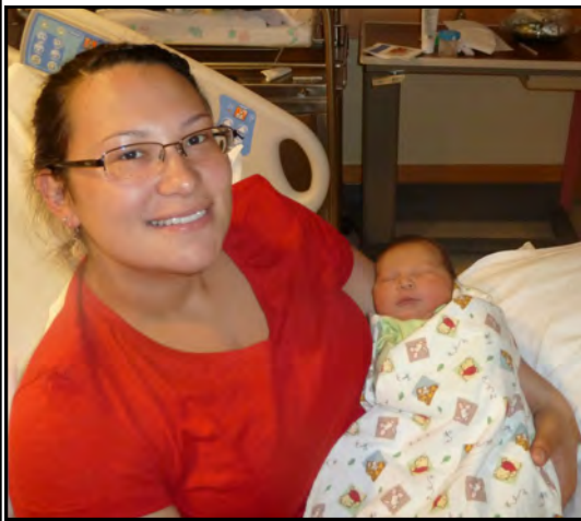
2 DAYS OLD