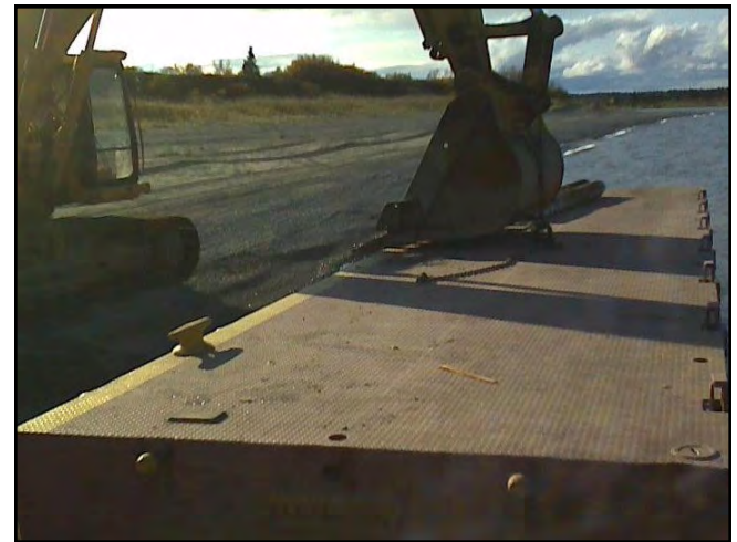
Taking the barge apart for the season.